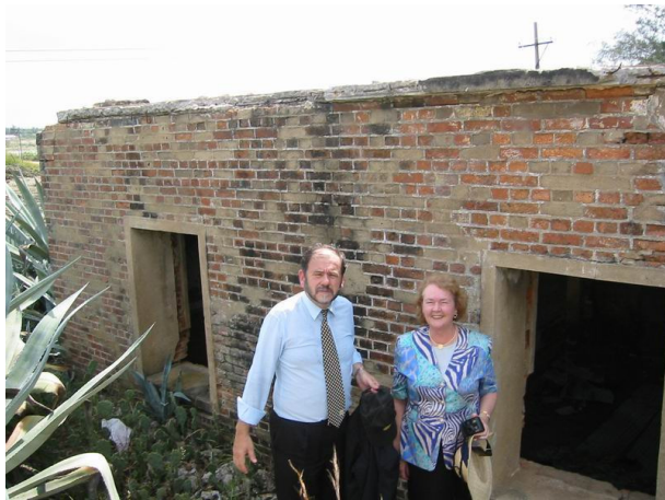
Photo 1 Outside one of the decaying prison buildings in Basuo

Not much is known in Australia about the connection with Hainan, nor the Japanese invasion of 1940, which preceded the attack on Pearl Harbor in December 1941. Australian troops captured in the Dutch East Indies, now Indonesia, were first held in prisoner-of-war camps on Ambon Island and thousands later transferred to Basuo on Hainan Island until subsequently liberated by the Americans in 1945.